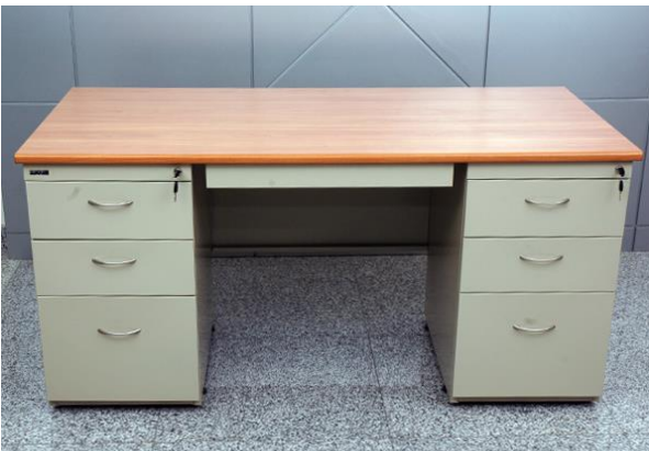
Double pedestal desk