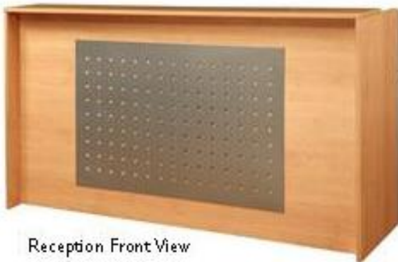
Reception Front View