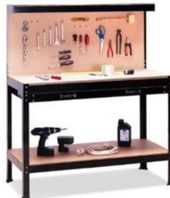
AUTOMOBILE TOOL CABINET