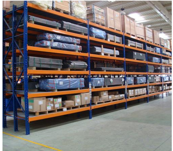
HEAVY & Medium DUTY RACK