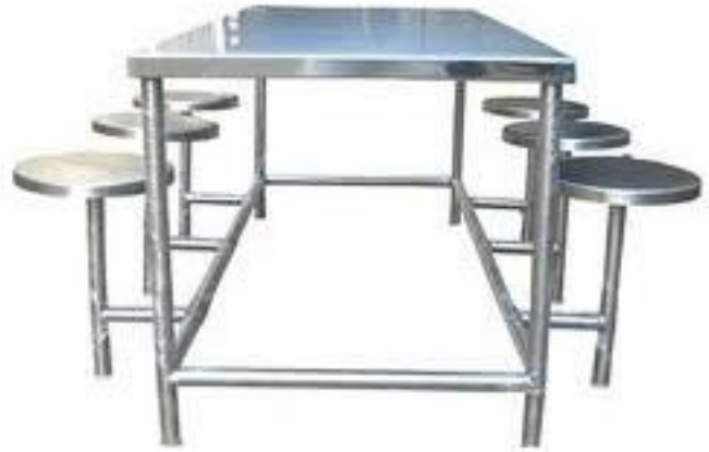
6 seater collapsible stool & Table