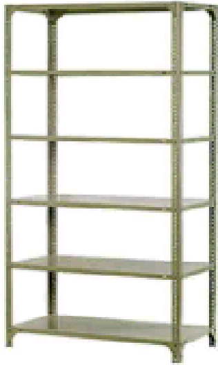
SLOTTED ANGLE RACK