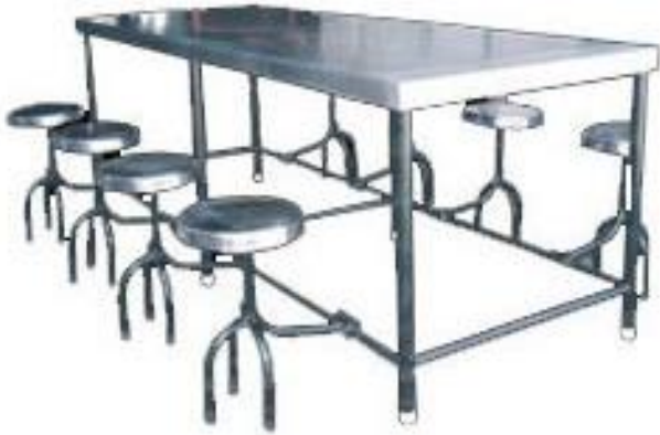
8 seater collapsible stool & Table