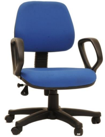
LOW BACK REVOLVING CHAIR