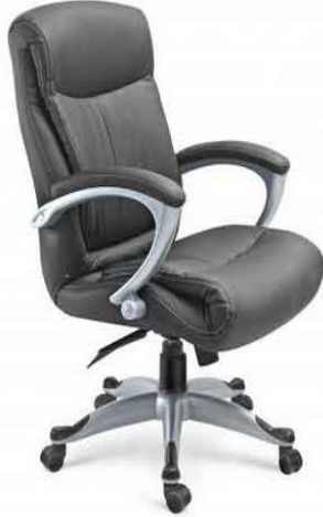
MEDIUM BACK REVOLVING CHAIR