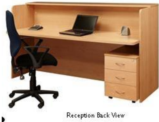
Reception Back View