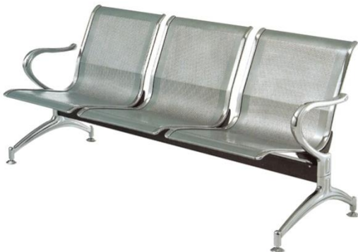
3 SEATER BENCH