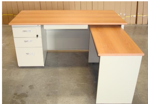
L Shape office Table