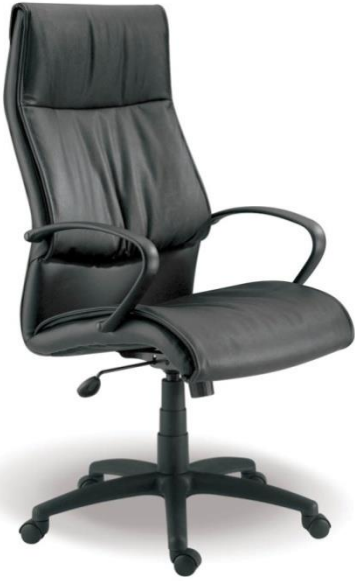
HIGH BACK REVOLVING CHAIR